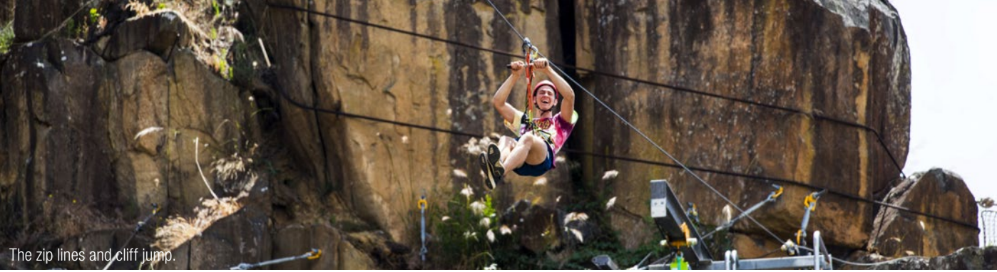
The zip lines and cliff jump.

Other experiences available include exploring Sarah Island and meeting the ghosts of convicts past. You can also launch your event with an exciting 32 pound cannon firing.