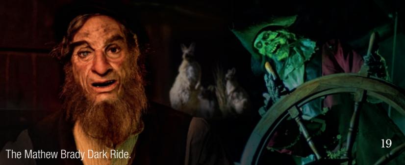
The Mathew Brady Dark Ride.