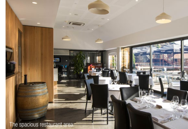
The spacious restaurant area.

Please note that there is a room hire fee per section or for the whole venue with FULL exclusivity. The room hire includes room and deck set-up, rectangular or square tables (clothed on request), wine barrels, chairs and in-house AV equipment including wireless microphone.