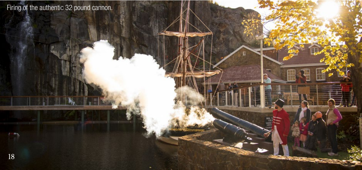
Firing of the authentic 32 pound cannon.